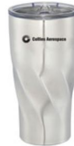
Hugo Copper Vacuum Tumbler